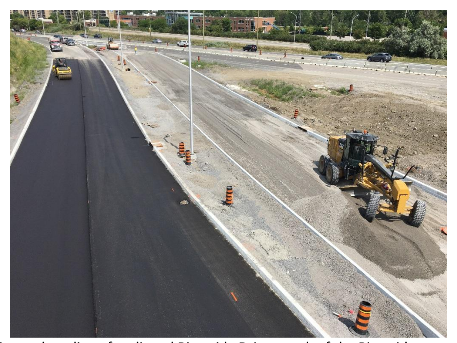
Paving and grading of realigned Riverside Drive, north of the Riverside structure.