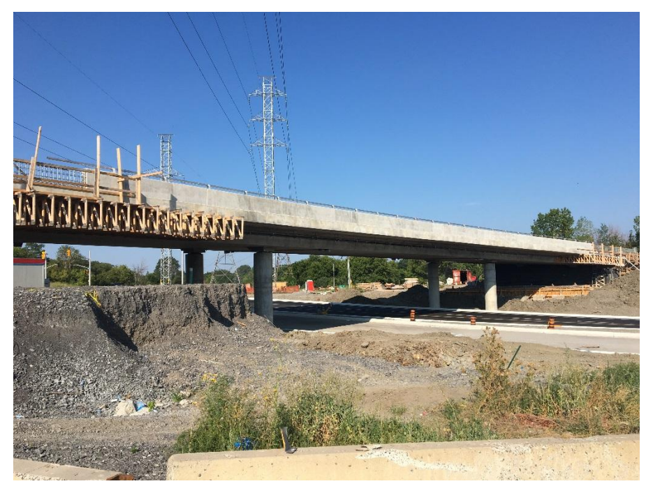
New Riverside structure.

The following pictures are provided for your information.