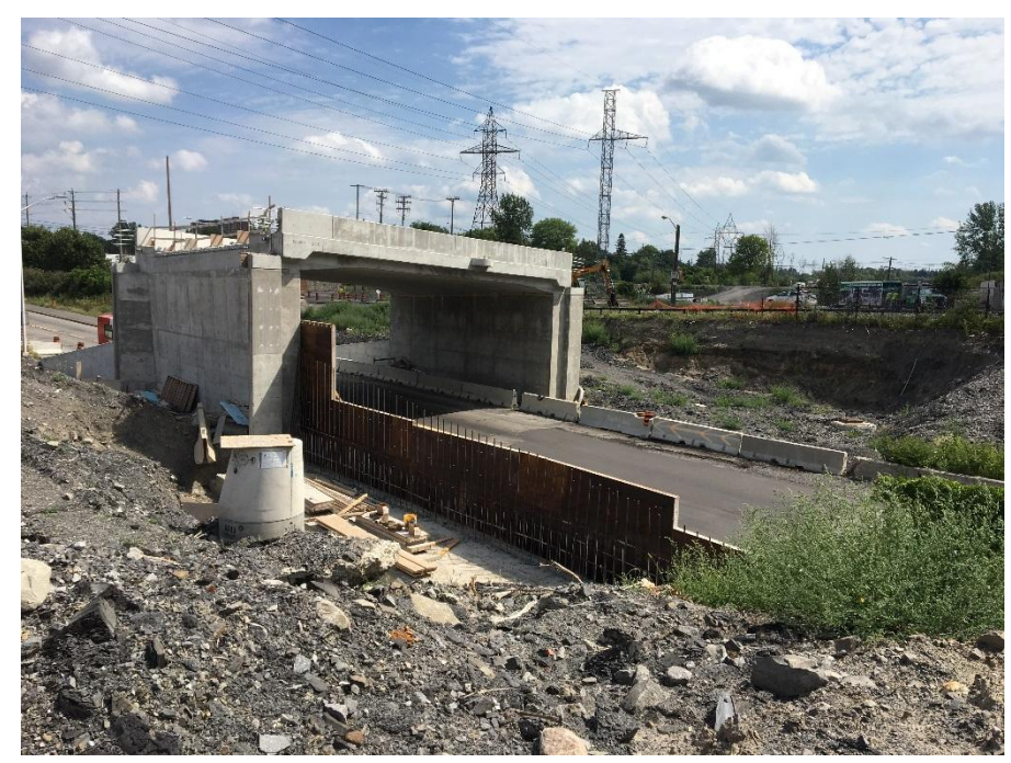
Construction of the southwest Transitway retaining wall.