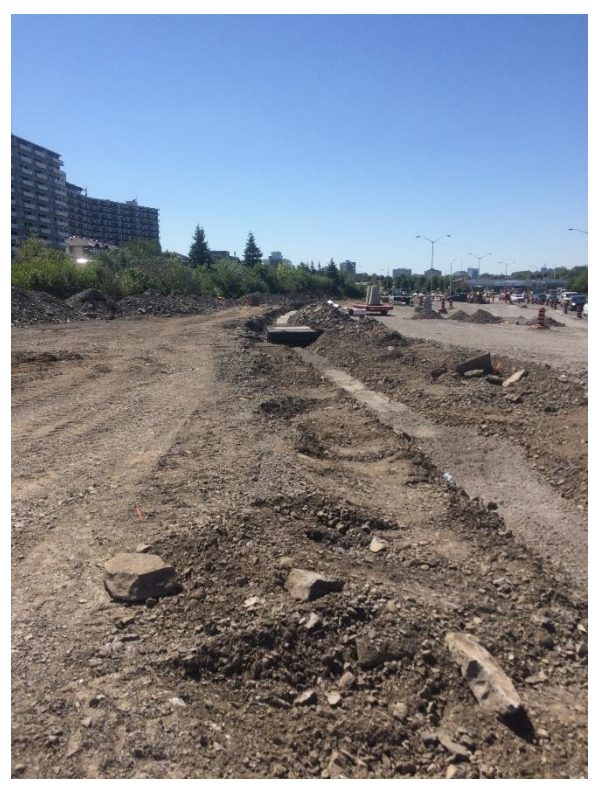
New Hydro duct and maintenance hole installed along the east side of realigned Riverside Drive.