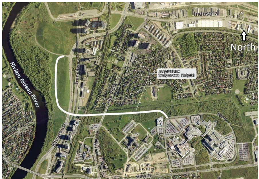
Key Plan of Hospital Link

Level of construction traffic will be medium to high through Hincks Lane, Old Riverside Drive, and Alta Vista Drive.