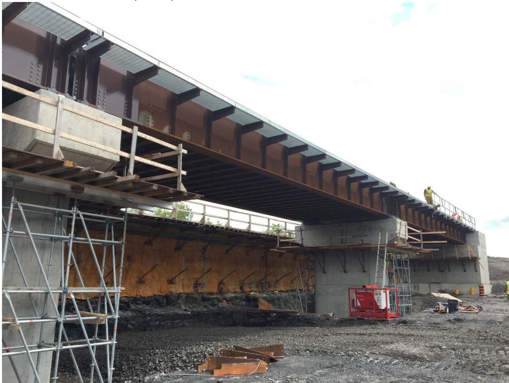
Construction of VIA bridge substructure.