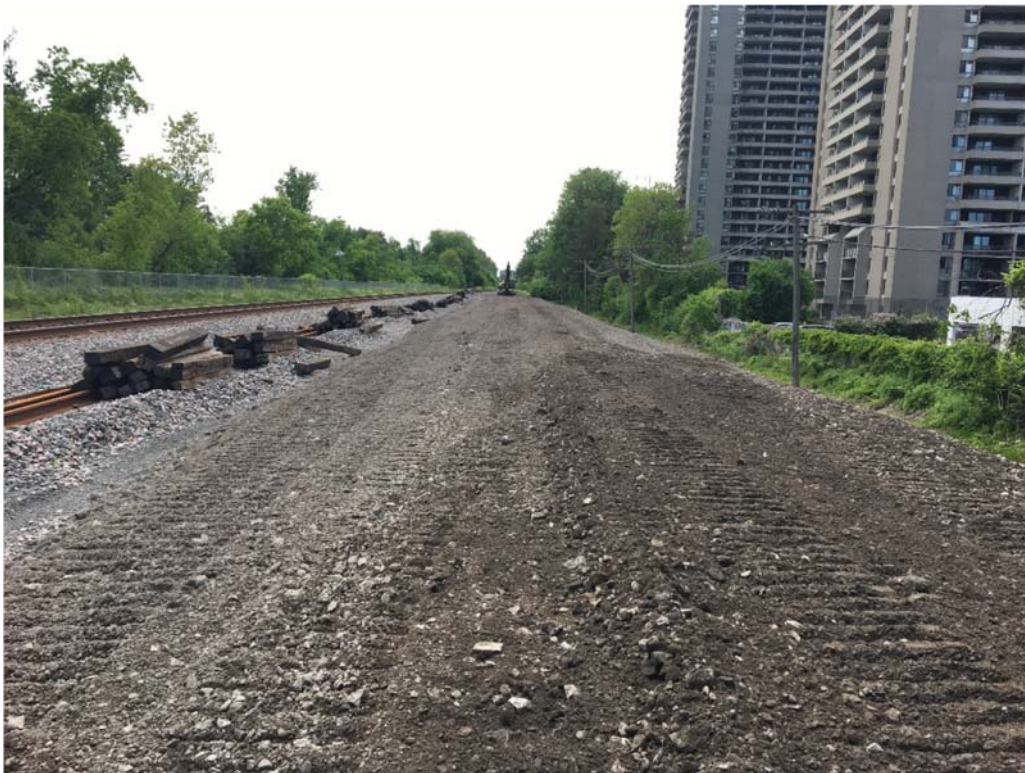
Preparation for the VIA grade raise for new mainline track construction.