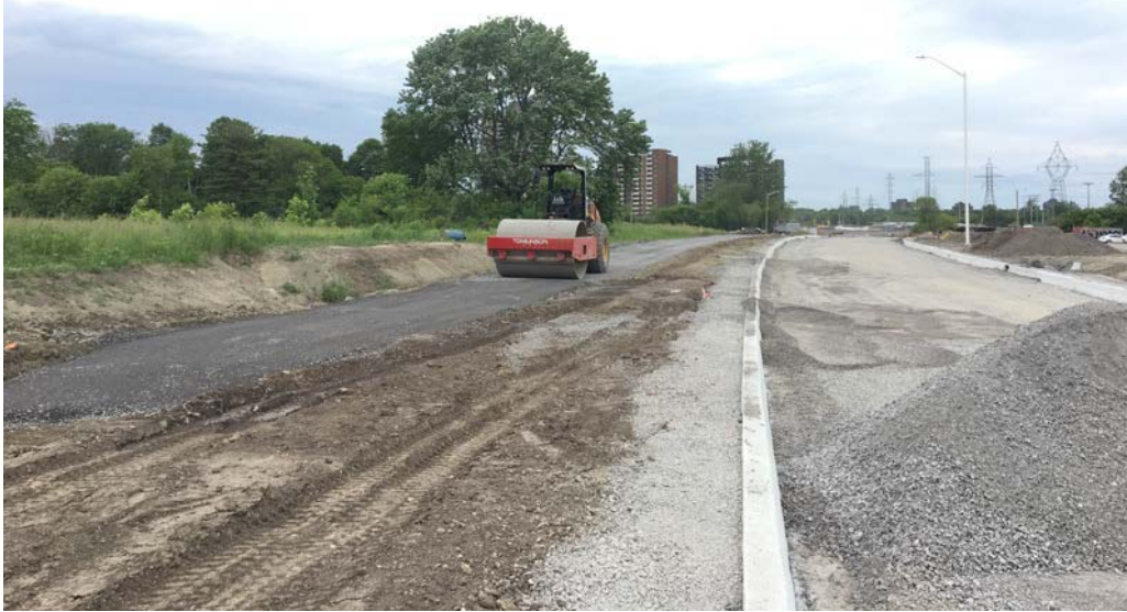
Placing and grading granular material for pathway along South side of Link Road east of Alta Vista.