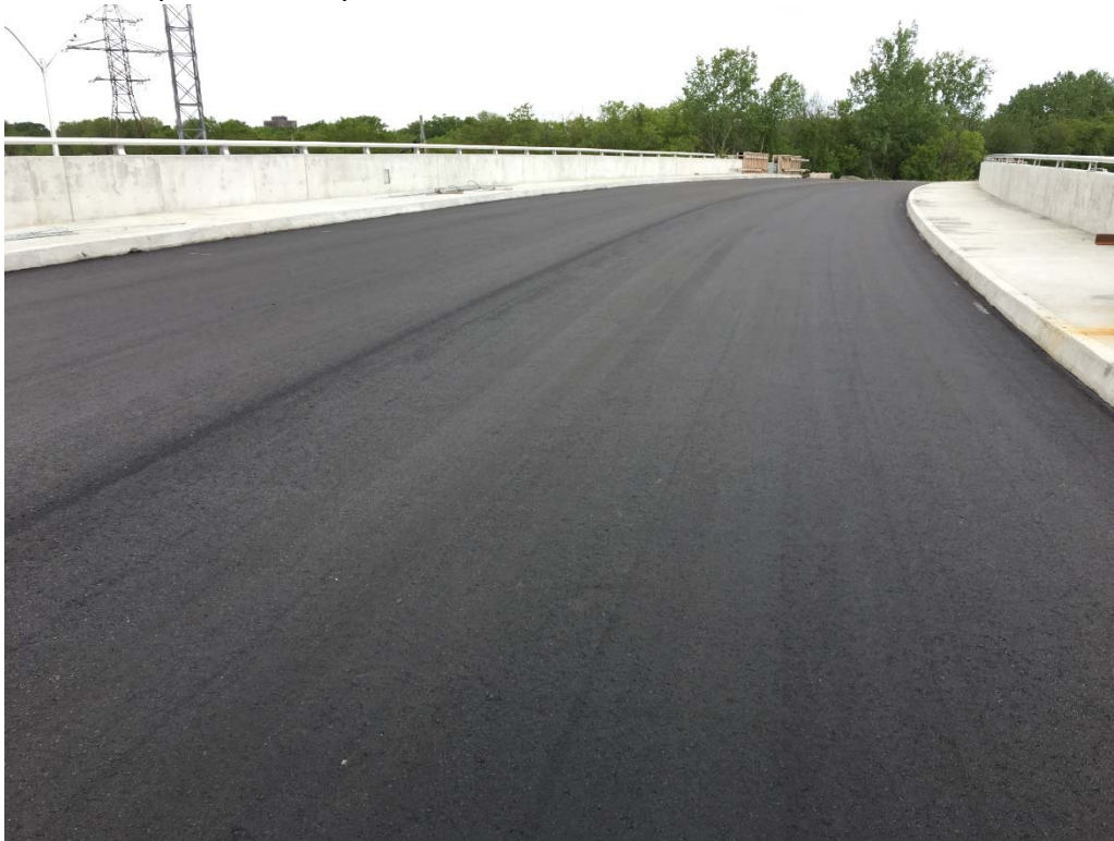
Asphalt placed on Riverside Structure deck.

The following pictures are provided for your information.